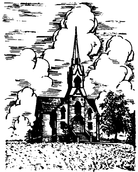
Indhorred Lutherara Cherch Sharbuck, Minnesoto