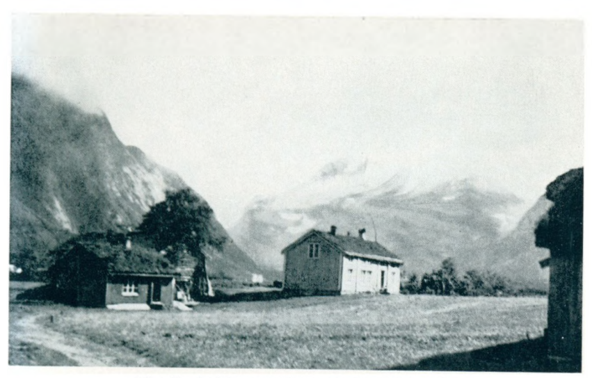
The Koefod farm at Nauste in Romsdal valley.